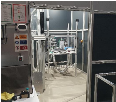
Figure 1: Long axis agitator

Laser Induced Fluorescence Measurements of different nozzle geometries to optimize the mixing process in a secondary combustion zone of a biomass combustion plant needs to be done. The LIF-System consists of a UV-Laser and a camera and will be used to investigate the mixing of gas streams. One gas stream is infused with acetone and its fluorescence will be activated by the UV Laser. The captured images will then be analyzed to find concentration fields.